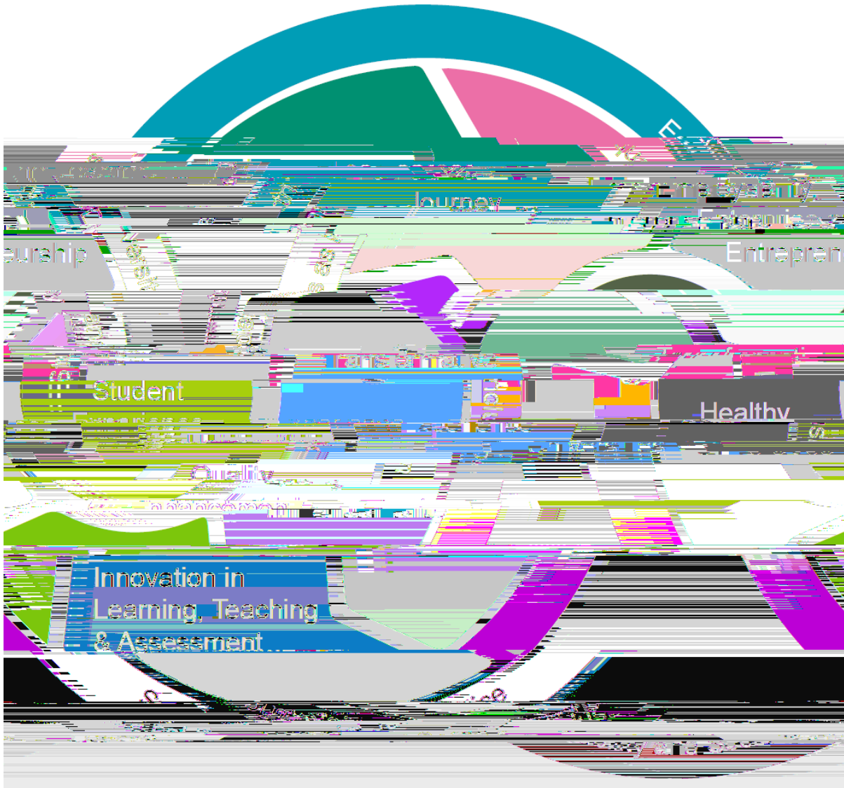
The QMU Student Experience Strategy 2021-26.

As the infographic shows, key areas of priority are presented under one of five action headings. These are supported by three overarching themes of Equality, Diversity and Inclusion; Students as Partners; and Sustainability and Social Justice that cut across the student experience during the period of Strategy. These themes are fundamental to the delivery of an outstanding student experience, and underpin all of our actions and activities